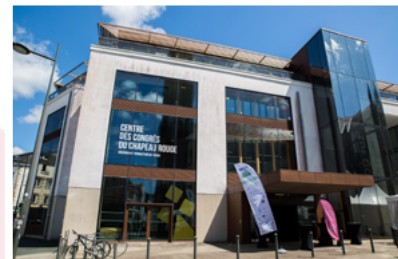
CONGRESS VENUE IN QUIMPER